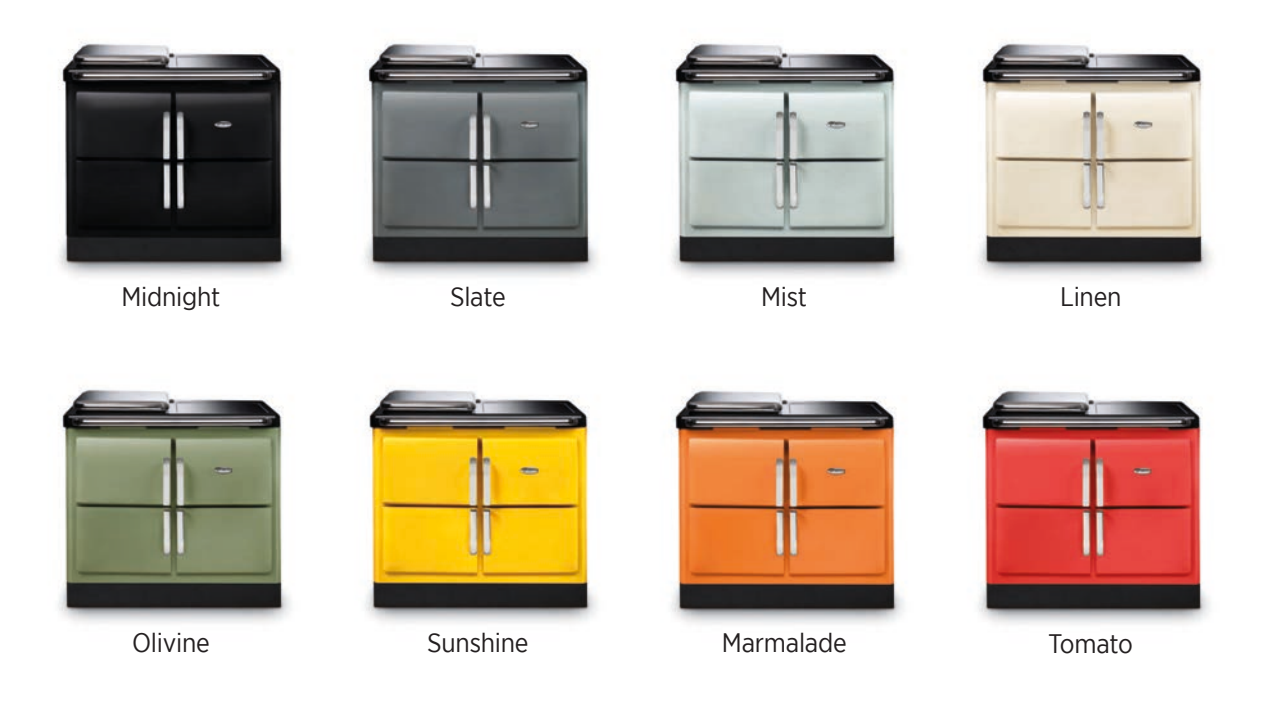
Note: Stanley NUA Electric side panels are black.

From natural neutrals to beautiful bolds, the Stanley NUA Electric is available in eight colourways*: