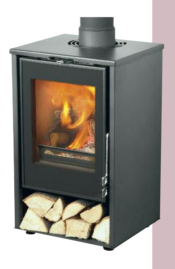
Serenity 40FW full length glass window