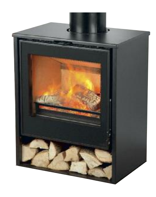
Serenity 50LS Log Store

The Serenity 50FS offers contemporary styling with high end performance and the ability to install in a chimney or free standing fireplace situation. A large viewing window of the fire and generous controllable heat output ensures that this stove will heat the larger rooms and equally offer a wonderful focal point for your room.