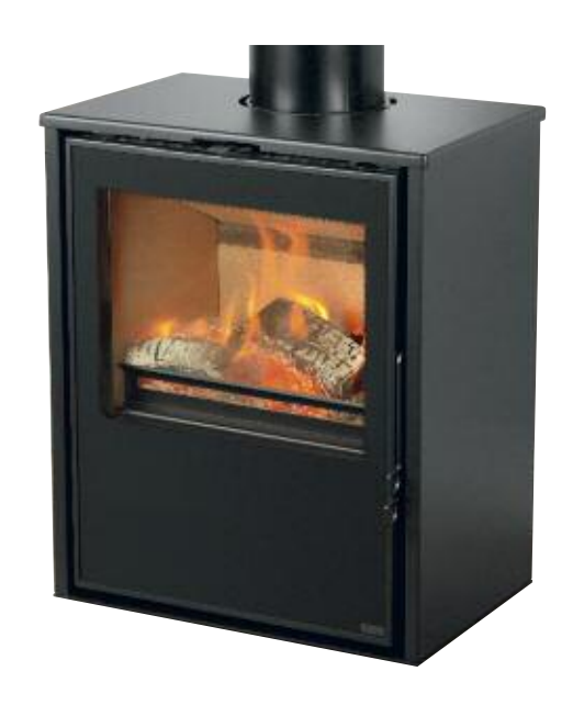
Serenity 50FW full length glass window