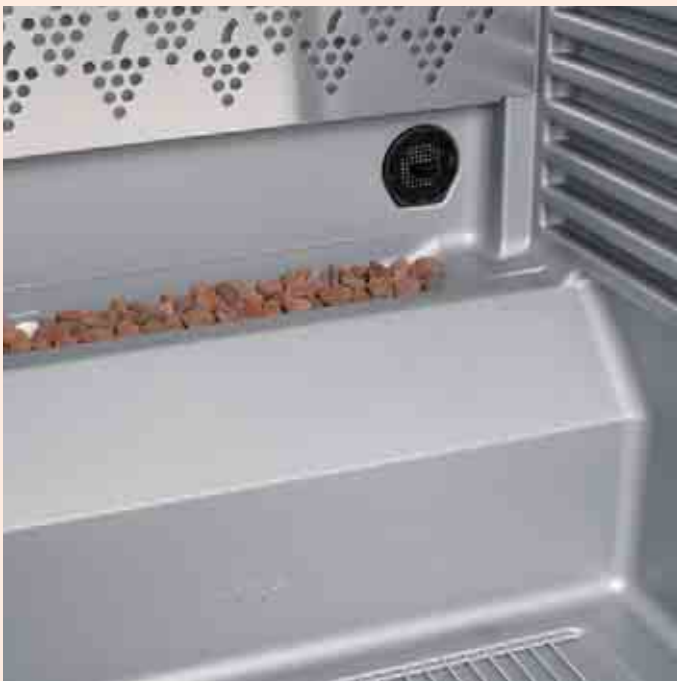
Ideal humidity via Lava stone. The humidity in the Vinothek models can be increased by using Lava stone.