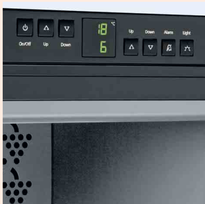
The wine cabinets are equipped with an accurate electronic control system with digital temperature display. These appliances incorporate a special climate control system that can layer the temperatures. In the upper zone, for example, red wine can be kept at +16 °C to +18 °C while the lower zone is set at an ambient temperature of +5 °C to +7 °C.

Multi-temperature wine cabinets are especially suited for storing different types of wine at their respective drinking temperatures. These appliances incorporate a special climate control system that can layer the temperatures. In the upper zone, for example, red wine can be kept at +18 °C while the lower zone, set at an ambient temperature of +5 °C, will be particularly suitable for sparkling wine or champagne.