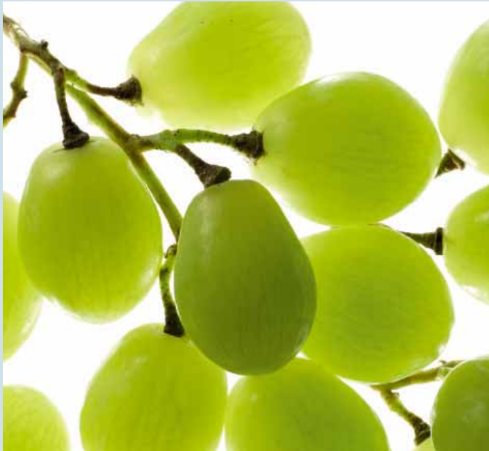
Grapes + 17 days