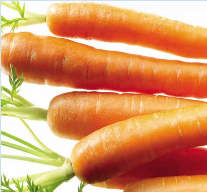
Carrots + 30 days