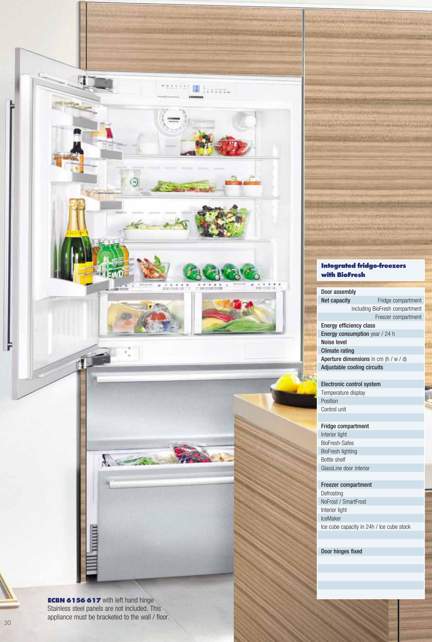
ECBN 6156 617 with left hand hinge Stainless steel panels are not included. This appliance must be bracketed to the wall / floor.