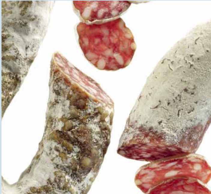
Salami +100 days