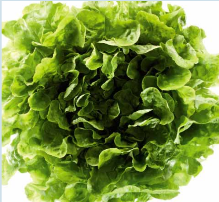
Lettuce + 8 days