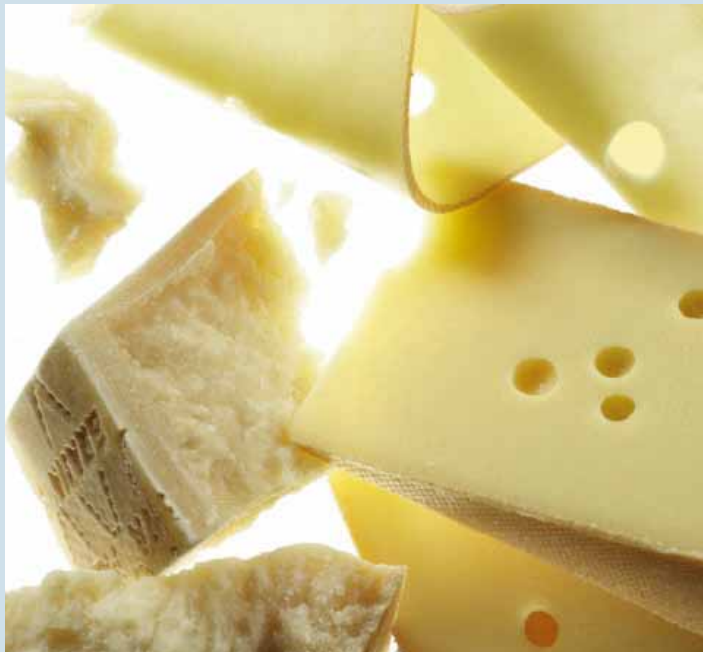
Cheese + 100 days

The information relates to storage in a BioFresh Drawer compared with a conventional fridge.