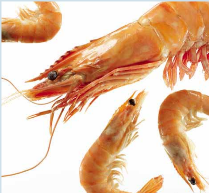
Prawns + 1 day