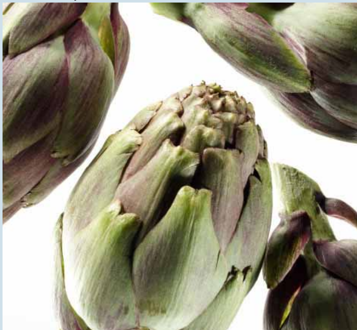
Artichokes + 7 days