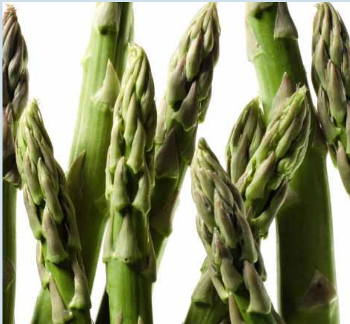
Asparagus + 8 days