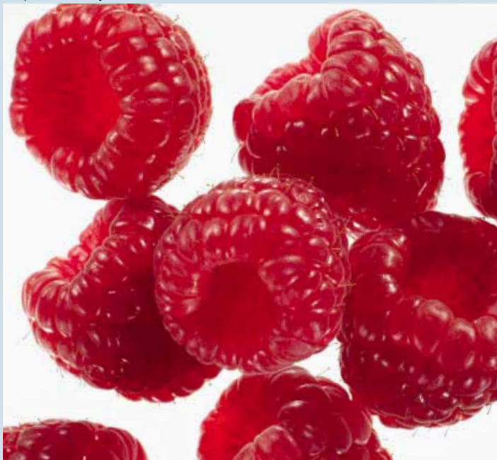
Raspberries + 2 days