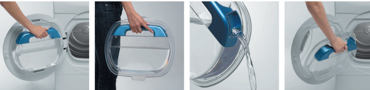
MORE ACCESSIBLE ERGONOMIC HANDLE CONVENIENT TO USE SIMPLE TO REPLACE

AQUAVISION IS MADE FROM A STRONG MATERIAL THAT: - CAN WITHSTAND HIGH TEMPERATURES - IS SCRATCH & OPACITY RESISTANT - IS DURABLE AND ROBUST; NUMEROUS COMPONENT TESTS PARTICULARLY ON THE HINGING MECHANISM VERIFY THIS.