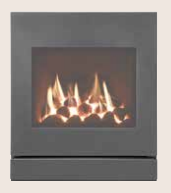
(Pages 4, 14 & 18)