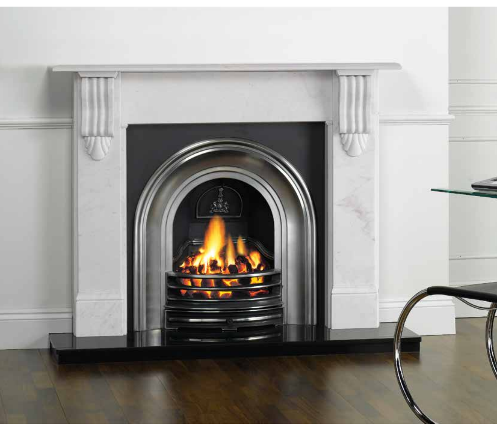
Above: Classic Arched Insert in highlight polished finish. Also shown: Victorian Corbel stone mantel in Antique White Marble from Stovax.

Cast Iron Inserts & Fronts - Conventional flue