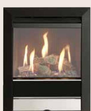
(Pages 6 & 16)