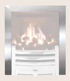
Polished Stainless Steel†