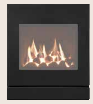
Graphite and Iridium^