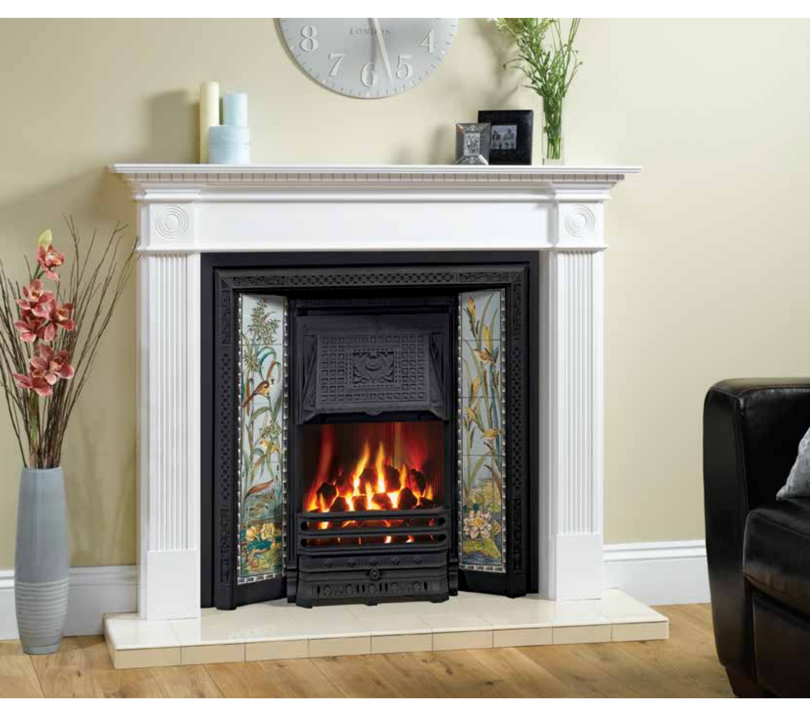
Above: Victorian Tiled Convector. Also shown: Georgian mantel in White from Stovax.

Cast Iron Convectors - Conventional flue