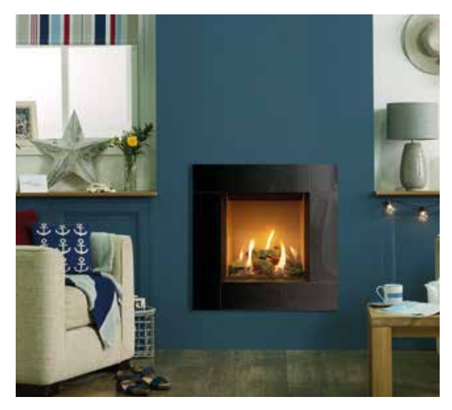
Riva2 400 Icon XS with Vermiculite lining

With highly realistic log-effect fuel beds, complemented by a wide choice of striking frames, mantels and lining options, this outstanding fire range can be perfectly tailored to your home's décor. Ask your local retailer for more information or download the brochure from www.gazco.com.