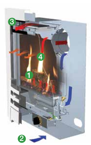
Balanced flue model shown.

The Logic HE box draws cool room air into the bottom of the convection chamber (2) the cool air is warmed as it passes over the hot surfaces of the chamber. Hot air is then emitted back into the room via the top convection slot (3). Maximum heat is radiated into the room via the glass front (4), with log models featuring specially designed non-reflective glass. The Logic HE balanced flue, Coal-effect fires have been specifically designed with reduced depth to allow for easy installation into the internal skin of a traditional cavity wall.