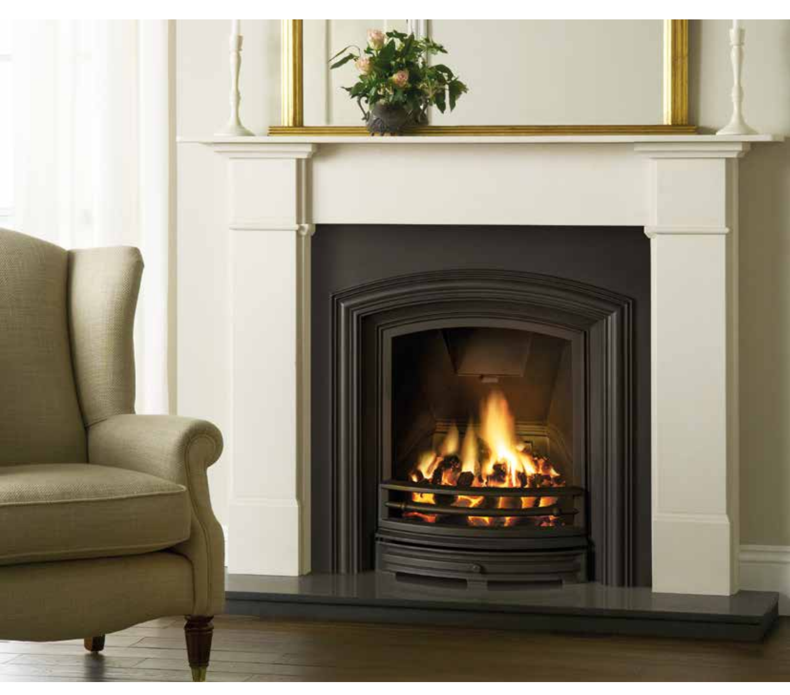
Above: Alexandra Inset in matt black. Shown with Claremont Limestone mantel

To view the Stovax Classic Fireplaces brochure and see the full range of fireplaces on offer, simply scan this QR code, visit www.gazco.com or speak to your local Gazco retailer.