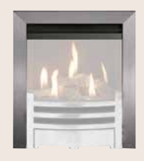
Brushed Stainless Steel†