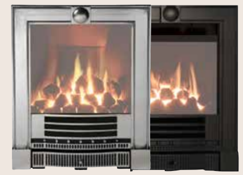
Polished† & Matt Black†