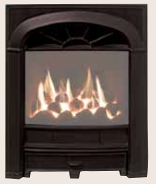
Black Cast Iron