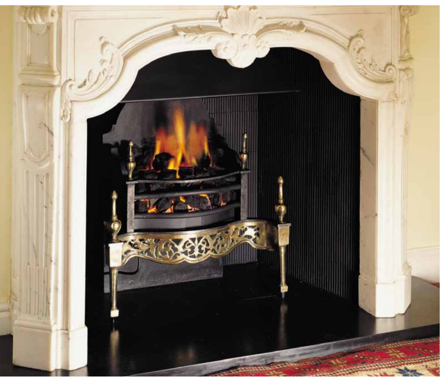
Gazco Made-To-Measure coal effect gas fire in an original grate & fireplace