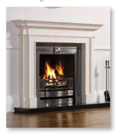
Made-To-Measure Fires Pages 38 - 39