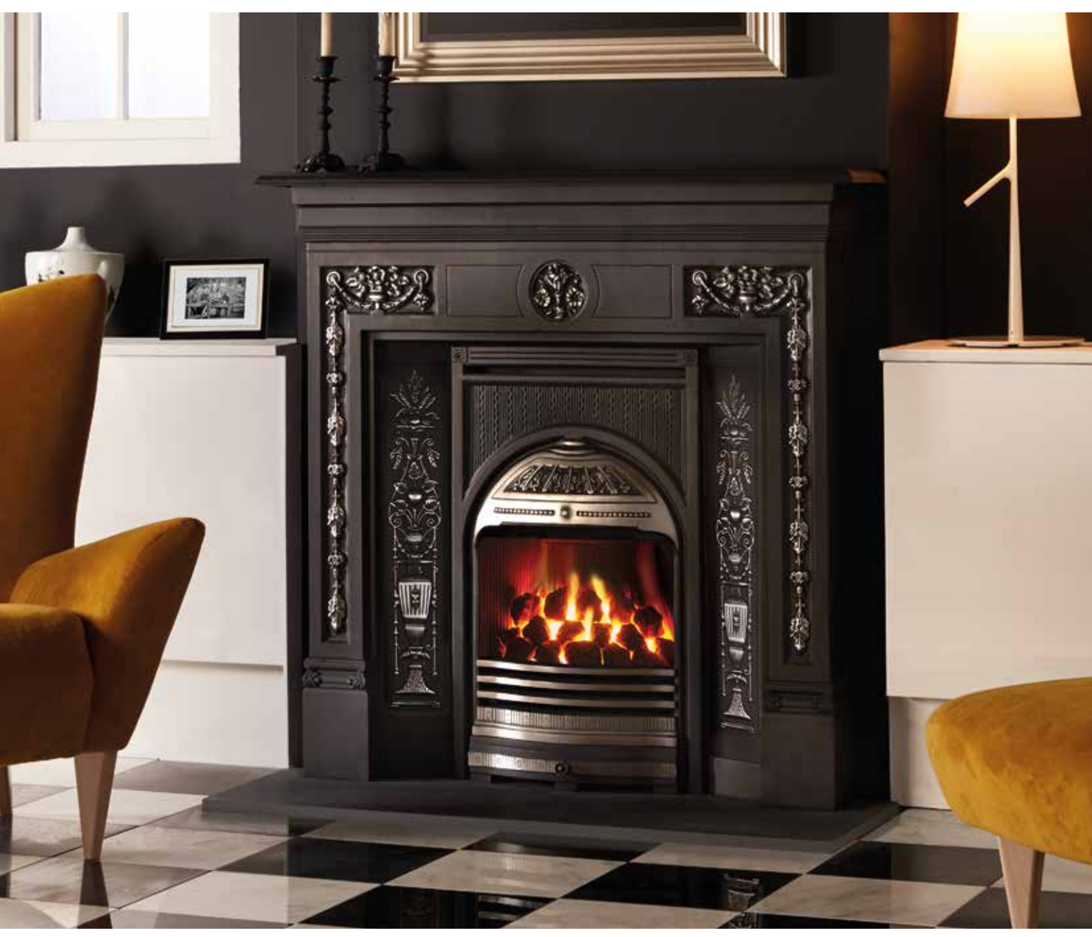
Above: Combination Convector in Highlight Polished finish with Urn design polished cast panels.

To enjoy the added efficiency and economy of convected heat, there are several models in the Classic Fireplaces range that can be fitted with Gazco's Logic Convector fires as shown earlier in this brochure.