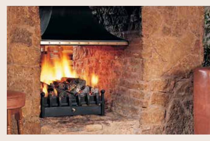
This log-effect fire is in a Devon restaurant. Gazco made-to-measure fires are suitable for domestic and commercial use. Please ask your retailer for further information about sizes, shapes and installation regulations.