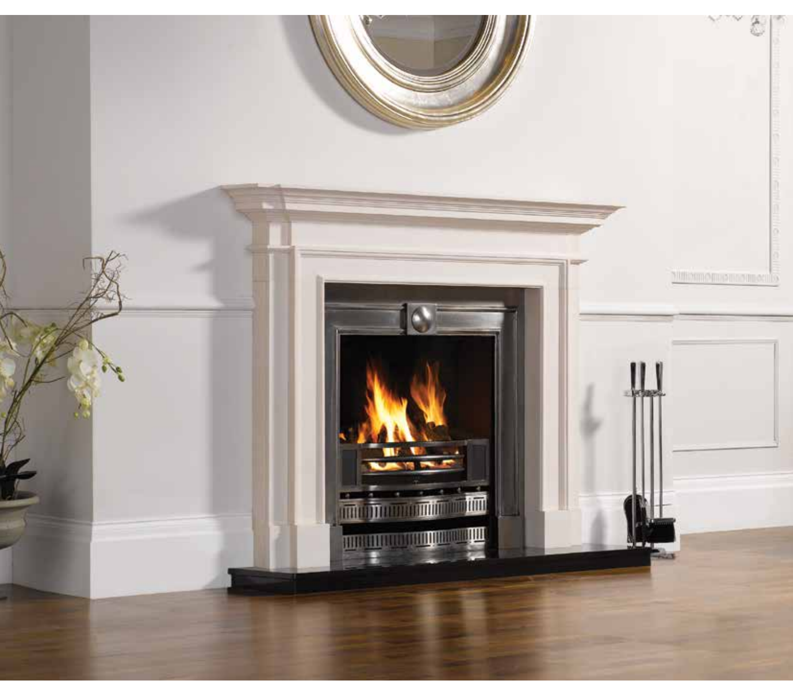
Above: Kensington Insert, fully Polished. Also shown: Sandringham Stone mantel in Natural Limestone from Stovax.

Cast Iron Inserts & Fronts - Conventional flue