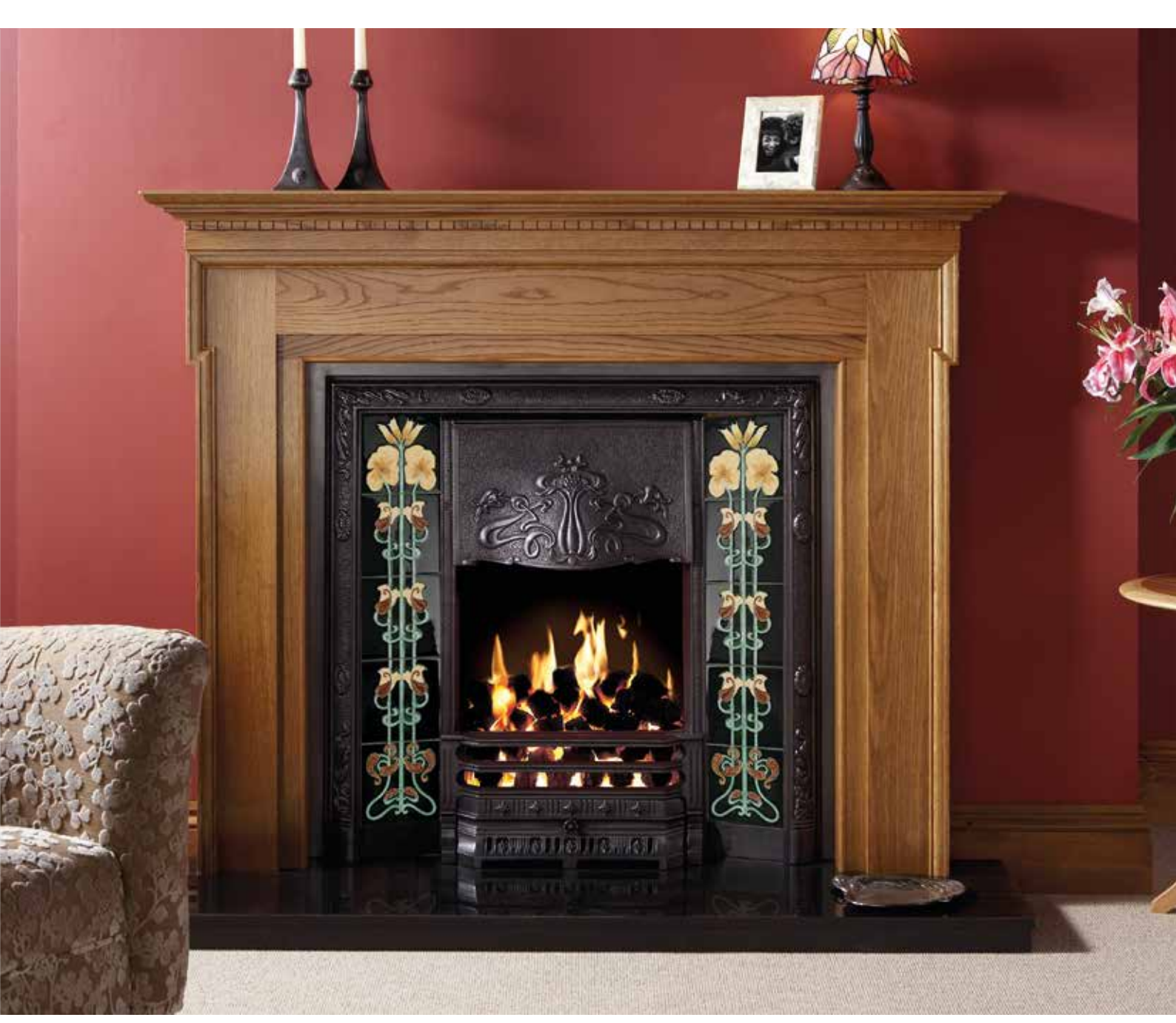
Above: Art Nouveau Tiled Front with 2 x Evening Primrose 5-tile sets. Also shown: Carlton Rich Oak mantel from Stovax.