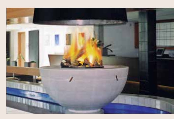
Gazco made-to-measure log-effect fire at Langs Hotel, Glasgow