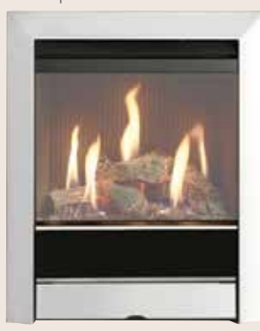
Polished Stainless, Brushed Stainless & Matt Black