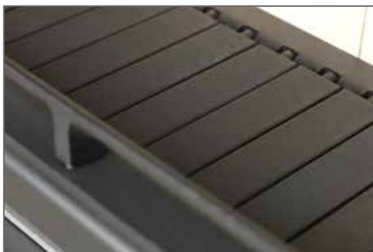
Two position grate shown in closed position for wood burning