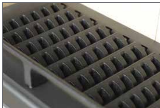
Two position grate shown in open setting for solid fuel