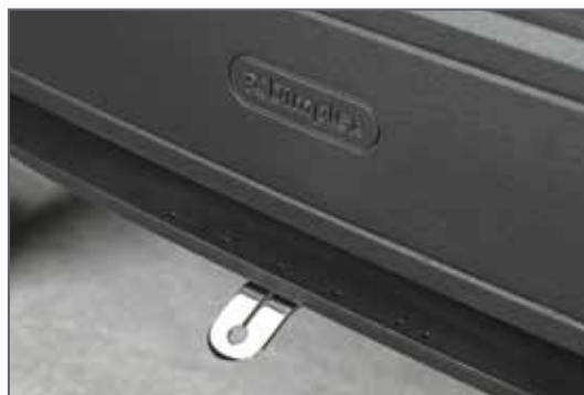
Single air control; left of centre-point for solid fuel, right of centre for wood burning

The Bellingham stoves sit at the top of the Dimplex range of multi-fuel stoves and deliver an exceptional combination of features, efficiency and clean burning. The freestanding models feature a user-friendly single air control with different settings for wood-burning and multi-fuel as well as a two position grate that can be set for the type of fuel being burnt. Most models are Defra-exempt to allow wood-burning in UK Smoke Control Areas and each freestanding model is equipped with a rear air inlet allowing the option of using direct outside air supply. The Bellingham range is made in Europe and benefits from the Dimplex 10-Year stove warranty.