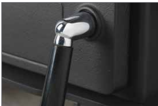
Stay cool black hand grip on door handle