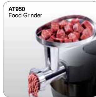
AT950 Food Grinder